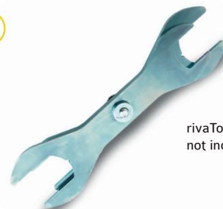
rivaTool All-in-one, not included in delivery